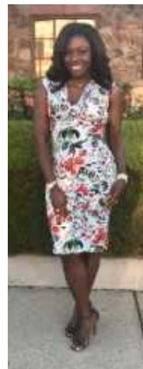
University of Memphis