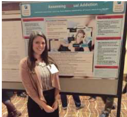
University of Houston- Clear Lake