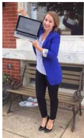
Loyola University Maryland