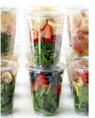
Samples of Packaging