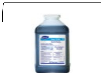
Diversey Virex II 256 J-fill 10 min