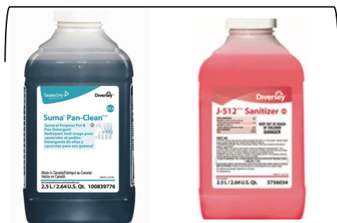
Diversey Suma Pan Clean or Suma Light Detergent