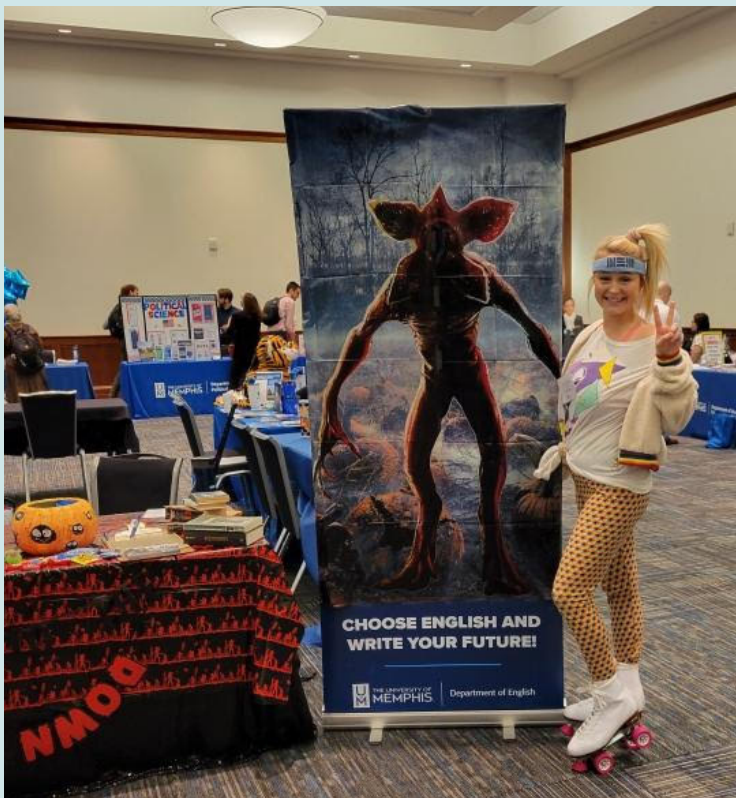
Discover Your Major Day