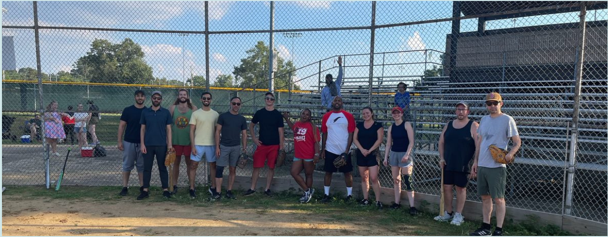
Grad Students vs. Faculty Softball Game